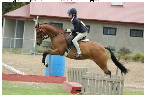
(above) Example of height of fences in assisted jumping section.

Jumps not over 40cm. Pony and rider combinations may be assisted by being accompanied but not led. Assistant may provide advice, guidance, and encouragement. Up to 3 attempts allowed per jump. All jumps will have wings.